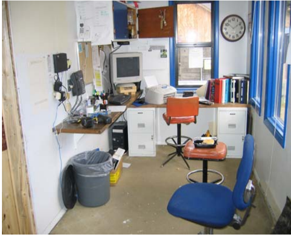
Before photo above & after photo below

You know there are 5 more work days scheduled before Bogus Basin opens. Show up on one of those days and help out before opening day comes around... EEE